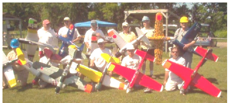
2008 Warbird Racers